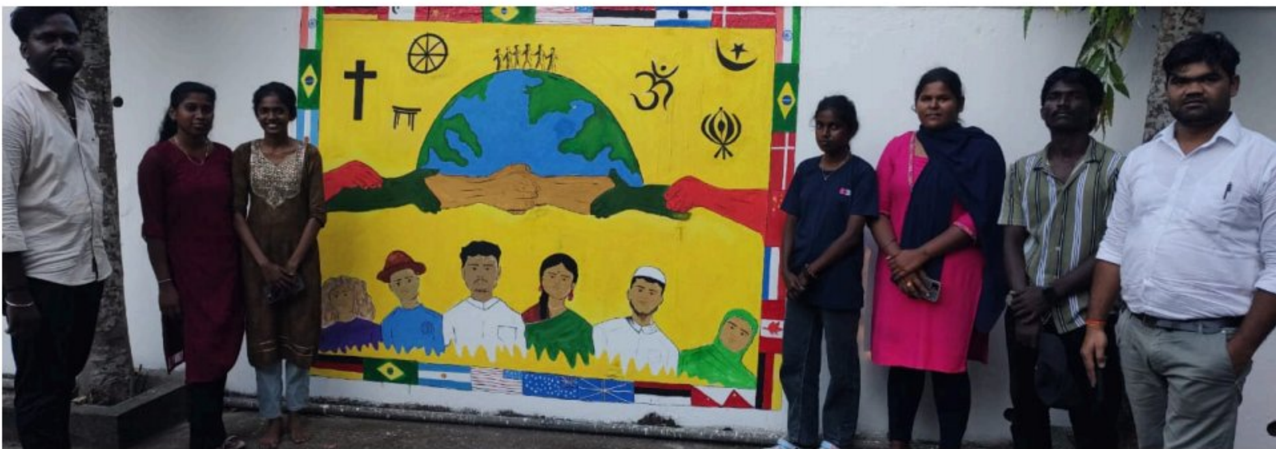
Painting Competition held at DBRAIT