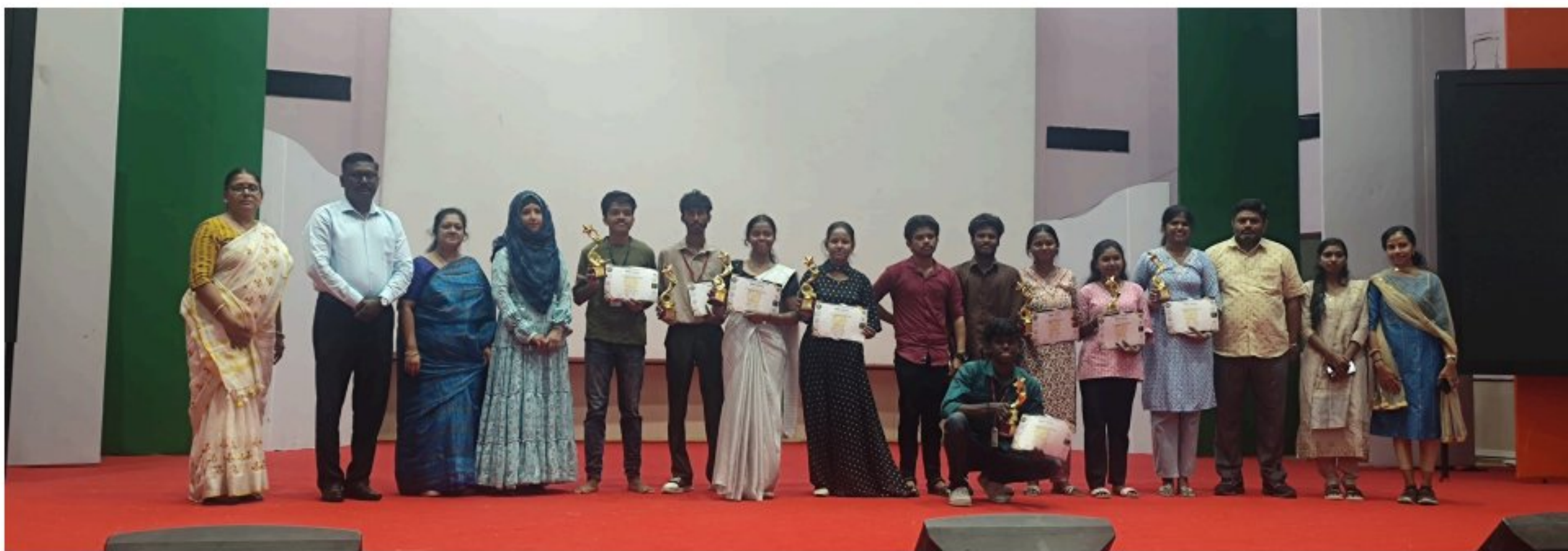
ANCOFEST Skit Competition Winners