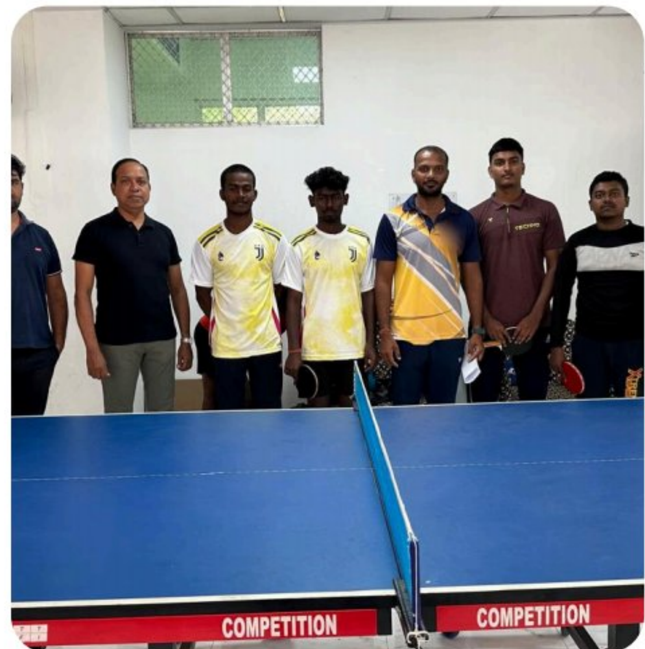
Table Tennis Team, ANCOL