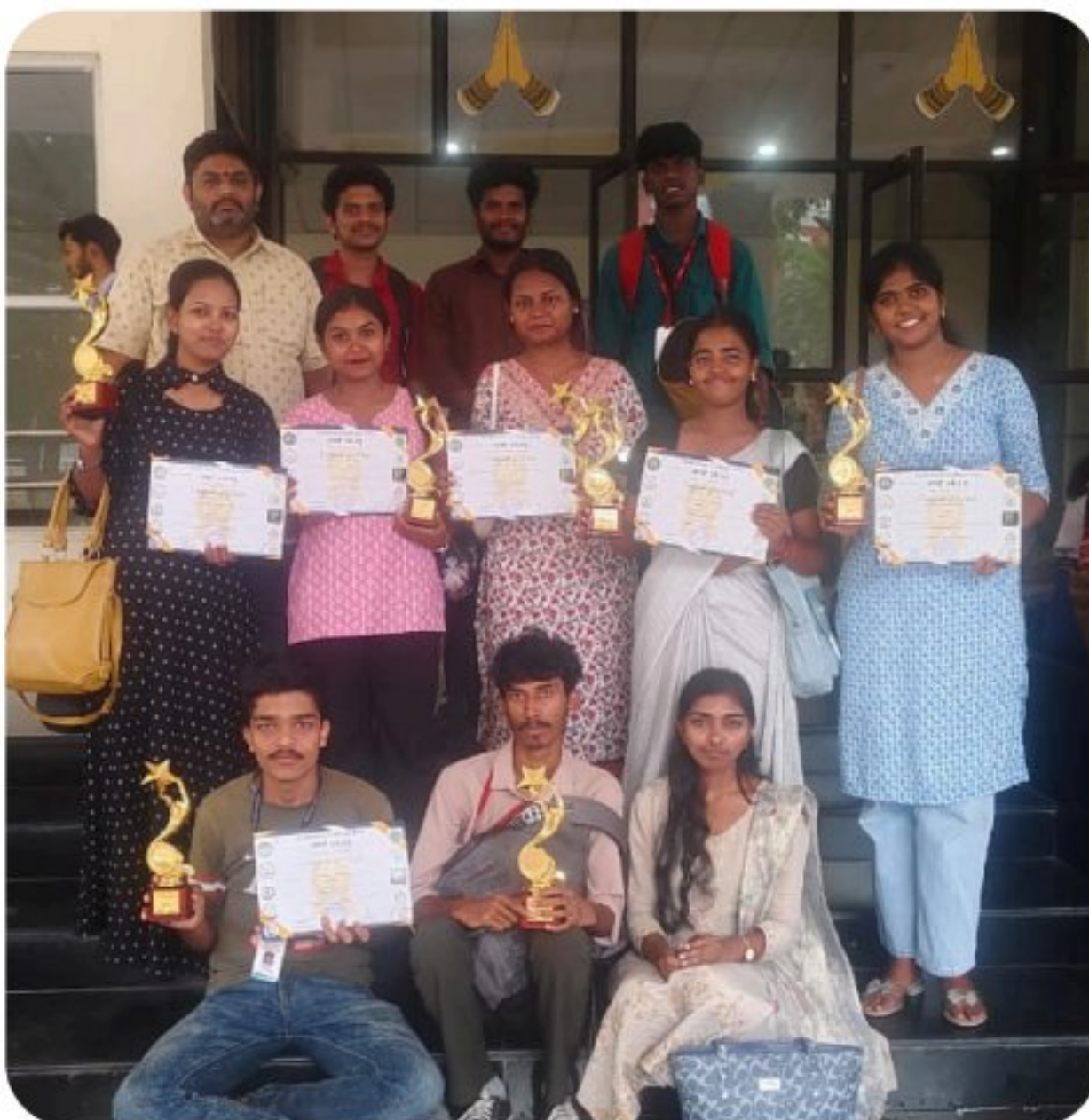
Skit Competition Winners