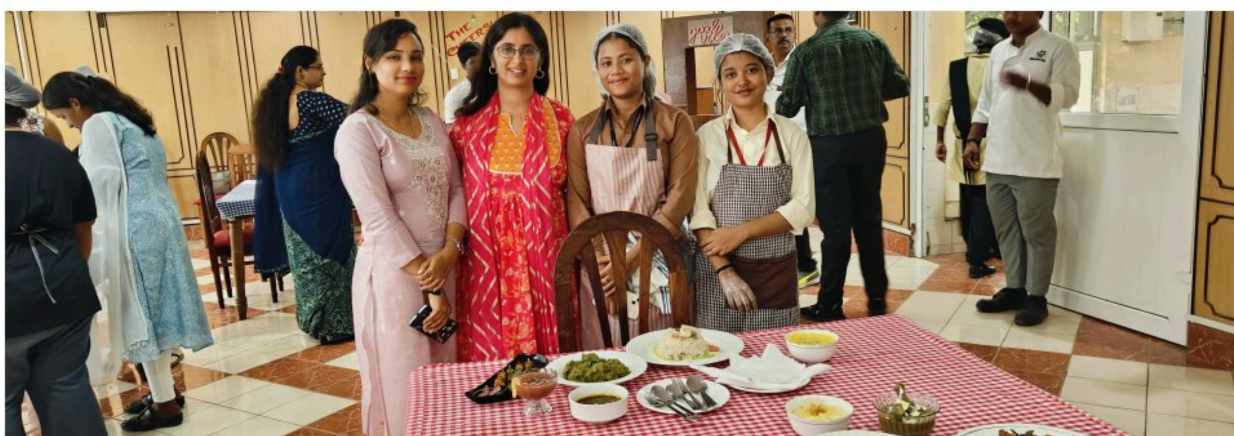
ANCOL Secured 3rd Position in Master Chef