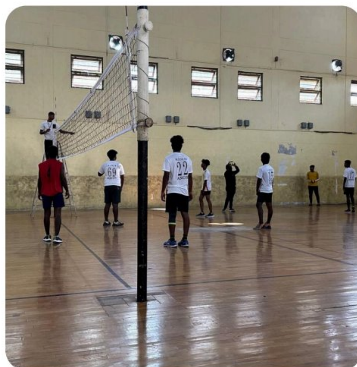
Volleyball Team of ANCOL