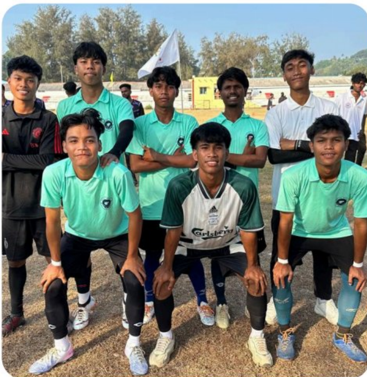
Football Team Players from ANCOL