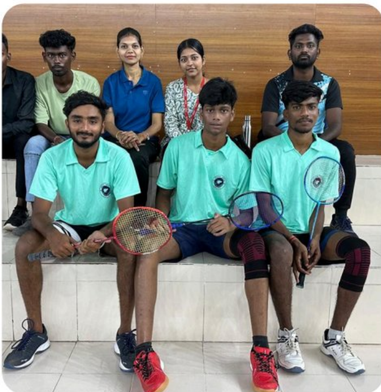
Badminton Team, ANCOL