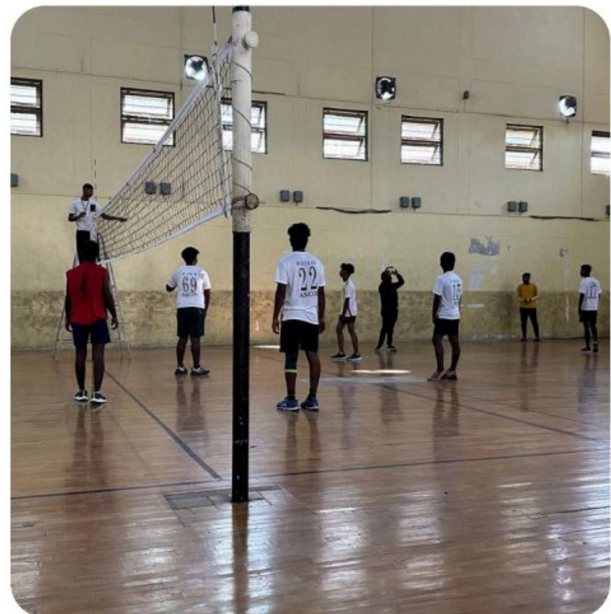
Volleyball Team of ANCOL