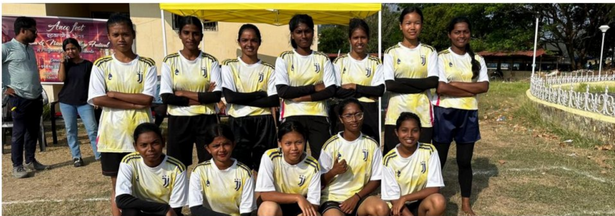
KHO-KHO TEAM, ANCOL